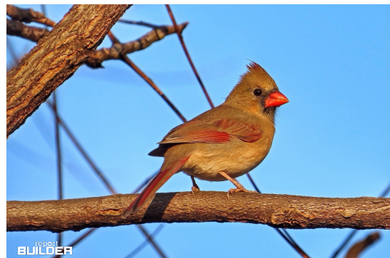
Female cardinals have the same crest on their heads as the red-feathered males.