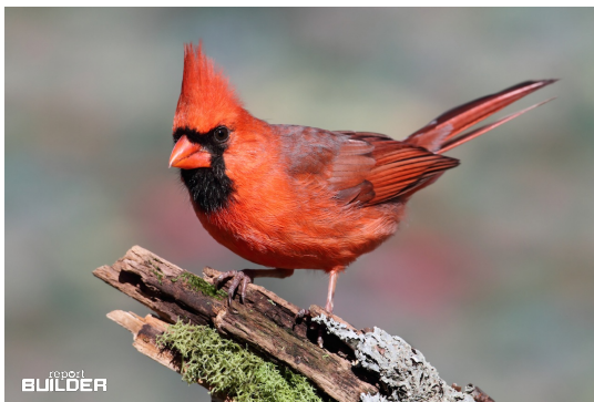
Male cardinals have bright red feathers.

Cardinals are songbirds. Some people think the cardinal sounds like it's singing, "birdie, birdie, birdie!"